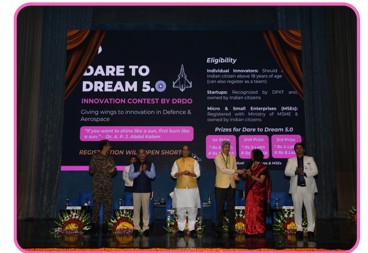
LAUNCH OF DARE TO DREAM 5.0