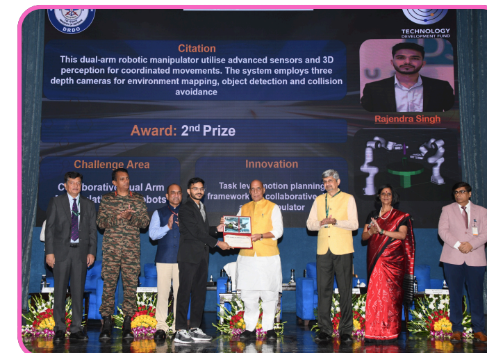
COLLABORATIVE DUAL ARM MANIPULATION FOR ROBOTS (INDIVIDUAL CATEGORY)