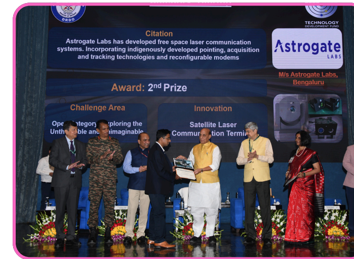
SATELLITE LASER COMMUNICATION TERMINAL (START-UP CATEGORY)

# Phase II Funding under TDF - 10 Startups