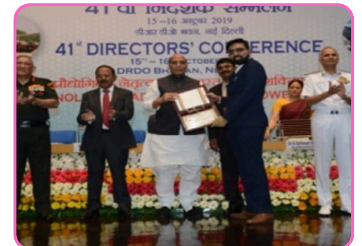
GREEN PROPULSION SYSTEM (SUCCESSFUL TECHNOLOGIES)